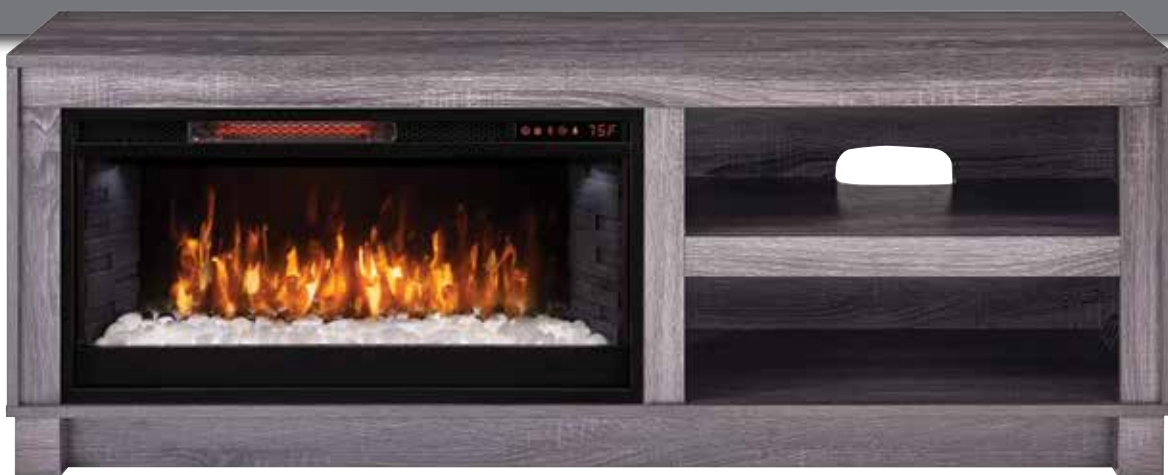
Shown with Gray Oak Melamine Finish