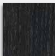
Black Oak Melamine (257)