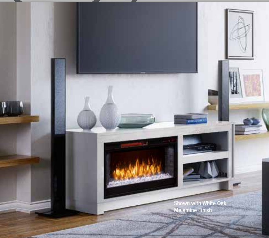
Shown with White Oak Melamine Finish

56" Fireplace Media Console with 28" Modern Infrared Electric Insert